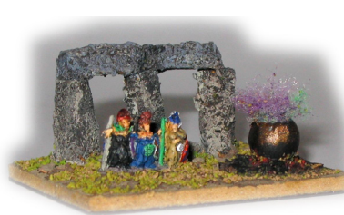
These are some 6mm Fantasy from Irregular Miniatures.

I created about 6 HoTT armies at a speed that even surprised me and for the grand total of only £40