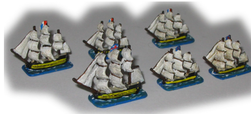
1/3000th Napoleonic ships