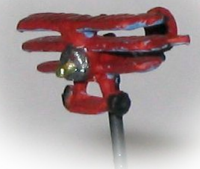
1/600th Fokker Triplane