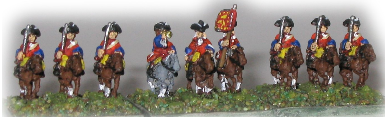
Baccus 6mm War of the Spanish Succession British Horse

Preparation - Cleaning and priming your models before painting is probably more important the smaller the size. File bases flat, remove flash, straighten spears and bayonets then a good wash in hot water with a little detergent is essential (I actually soak mine in vinegar before washing, but that is frowned on by some). Priming is also important but quite contentious - should you use white, black, grey or the base uniform colour? Should you brush or spray. Personally I use a darkish grey spray but do sometimes overpaint that with a thinned black wash to bring out the detail and fill voids.