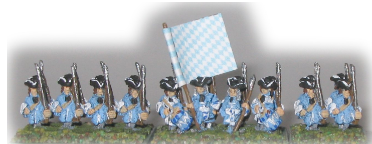
6mm WSS Bavarian Foot battalion