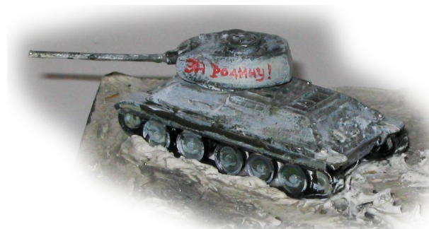
A 10mm T34 in the snow.

I think 10mm will appeal most to 25/28mm gamers who want to downscale. They have enough detail to allow differentiation between units quite easily but are small enough to achieve the 'mass effect' of 6mm on a larger table. As noted above, the only limitation may be the lack of completeness in many ranges.